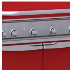
Stainless Steel Concealed Control Panel & Front Shelf