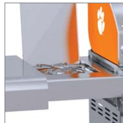
Concealed Side Burner