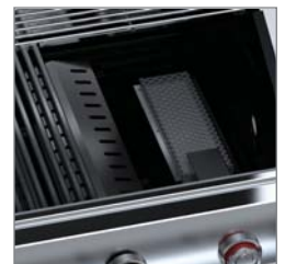
Infrared Searing Burner