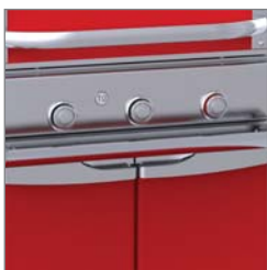
Stainless Steel Concealed Control Panel & Front Shelf