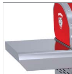
Stainless Steel Side Shelves