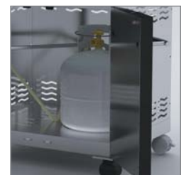
Under-Grill Storage for Gas Tank