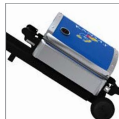
Folds for Easy Transport & Storage