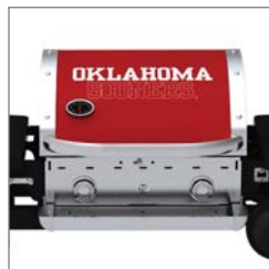
Table Top Cooking Mode