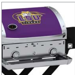
Stainless Steel Concealed Control Panel & Front Shelf